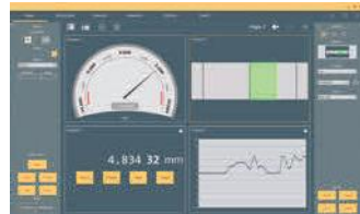
Multi-channel display with colour-coded tolerances