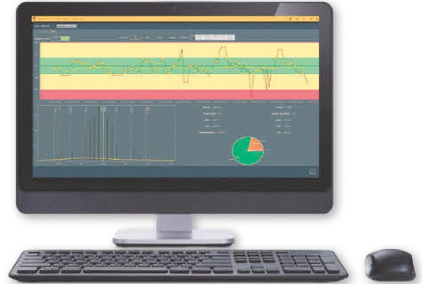
Free Sylcom LITE version on www.sylvac.ch

The concept is to offer a modular software application based on the specific functionalities required.